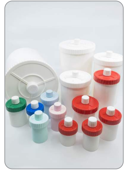
The jars sized from 15 ml to 2000 ml