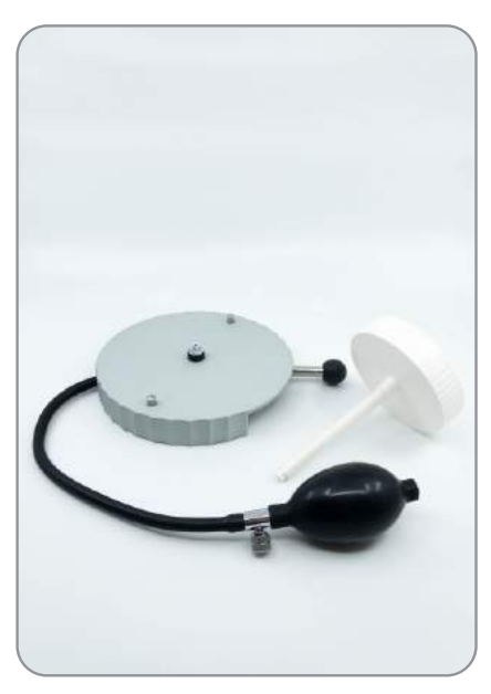
gako unguator AirDynamic and spindle: the perfect assistant for dispensing compounds from larger jars