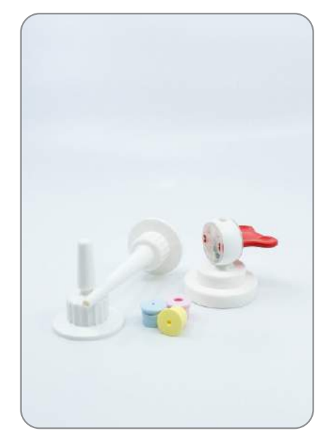
Varionozzles, applicators and the ExactDose for specific applications and exact dosage - compatible with all jars up to 1000ml