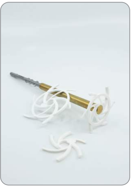
gako unguator disposable blade: Ideal for emulsions, gels and low viscous formulations

gako unguator standard mixing blade: The standard mixing blade for suspensions and highly viscous formulations